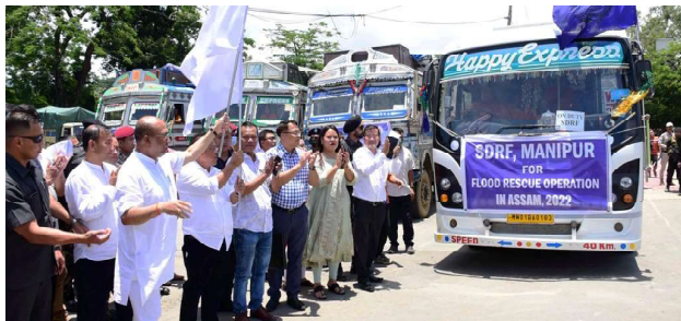
IT News Imphal, June 27:

Chief Minister N. Biren Singh flagged off vehicles carrying relief assistance and personnel of State Disaster Response Force (SDRF), Manipur for flood victims of Assam from Kangla Western Gate, Imphal today. The relief materials were sponsored by the Department of Relief & Disaster Management, Government of Manipur.