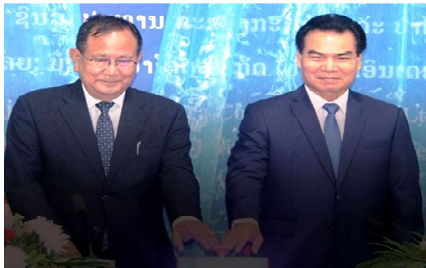
IT News Imphal, June 27:

Representatives of the Indian and Lao governments have launched a project to build the Nam Xang storage dam and irrigation system in Kaenthao district, Xayaboury province.