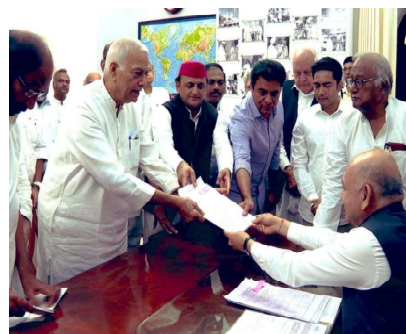
named as the common candidate of the Opposition for the Presidential elections.

“I am overwhelmed with feelings of gratitude towards you and leaders of all the Opposition parties for choosing me unanimously as your common candidate to contest the Presidential Election, to be held on July 18, 2022. I thank you for the trust and confidence they have reposed in me. I assure you — and the People of India — that, if elected, I shall conscientiously uphold, without fear or favour, the basic values and guiding ideals of the Indian Constitution. In particular, as the Custodian of the Constitution, I shall not allow the light of democracy and secularism to be dimmed by the executive,” Sinha said in a letter. On June 21, Sinha was