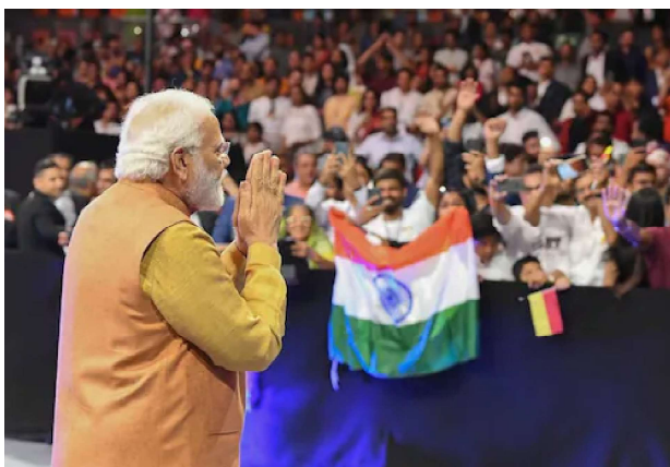
Agency Elmau (Germany), June 27 :

Prime Minister Narendra Modi will attend the G7 Summit here in Germany in which leaders of the world's seven richest countries will discuss various important global issues,